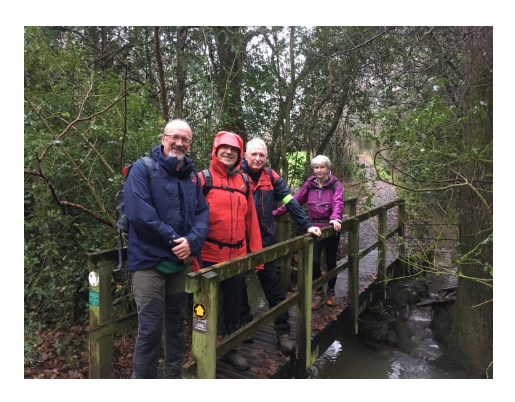
On L & below marshals' walk, on R registration