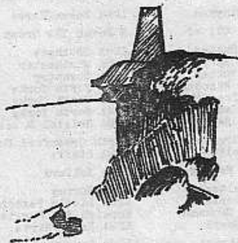
Checkpoint 21 Kettlebury Hill