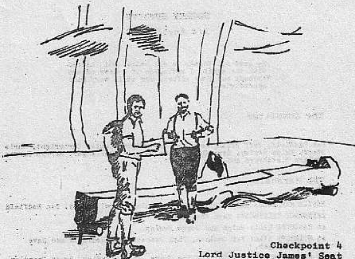
Checkpoint 4 Lord Justice James' Seat