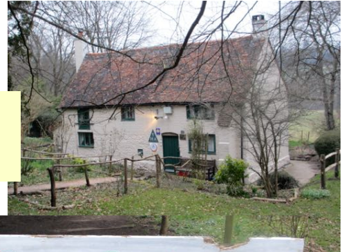
Tanners Hatch YH - setting for the inaugural meeting of the LDWA