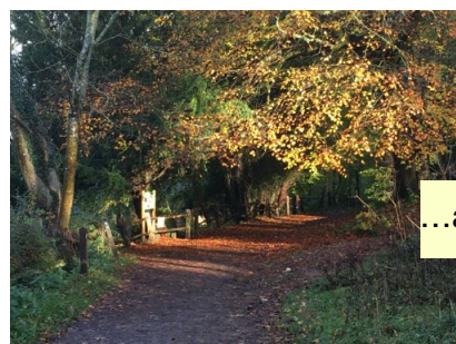
...along the way