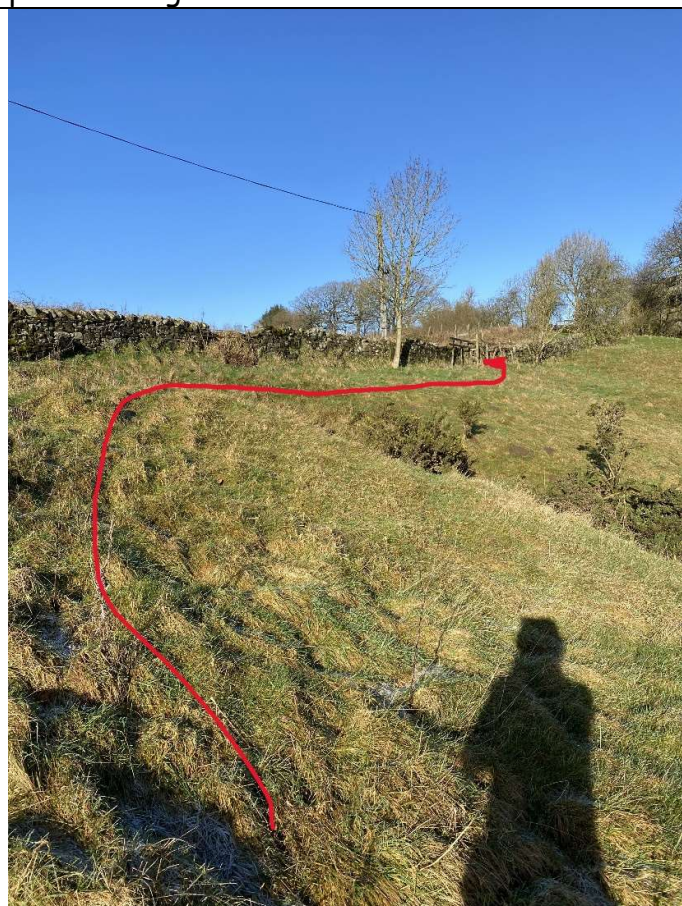
8 - turn right and follow faint trod