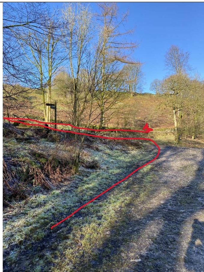
3 SE15655687 - turn left then right to steps in wall on left