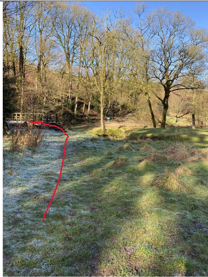
1 SE15755680 - take footbridge on left