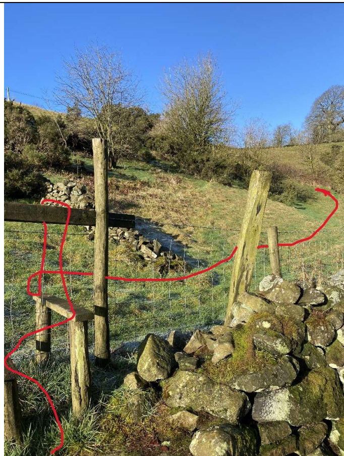
6 SE15875655 - over stile and head right to pass below gorse bushes