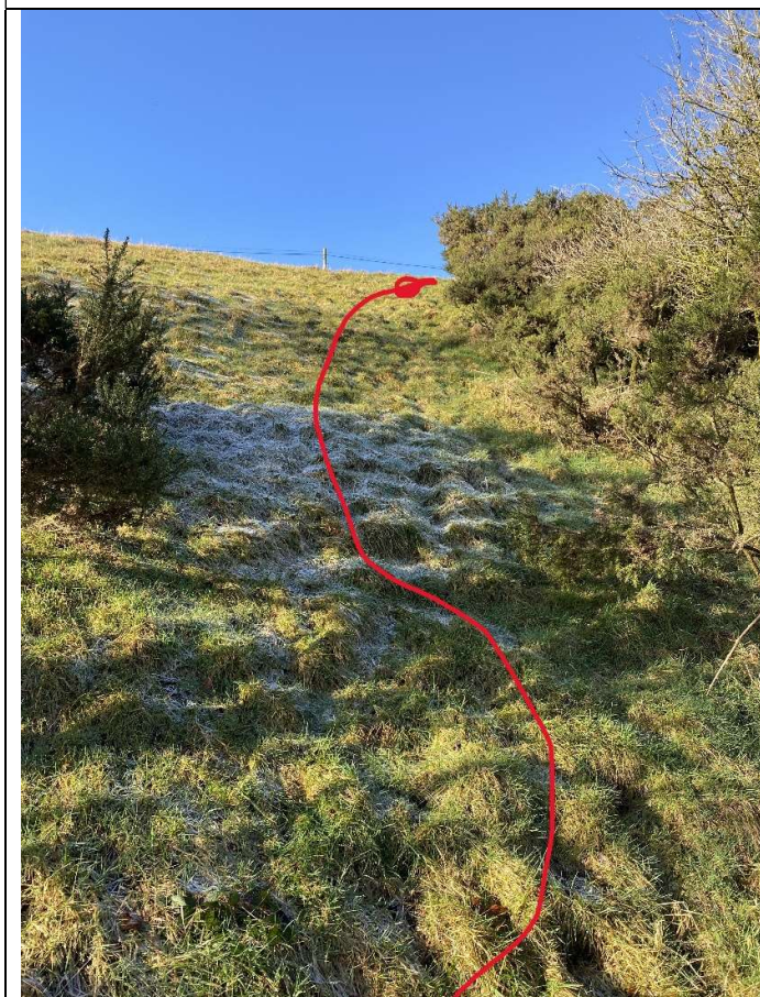
7 - then ascend over grass towards wall