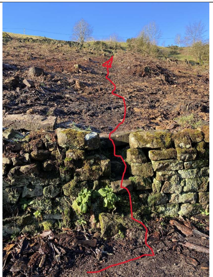
4 SE15625687 - up steps and ascend over cleared ground