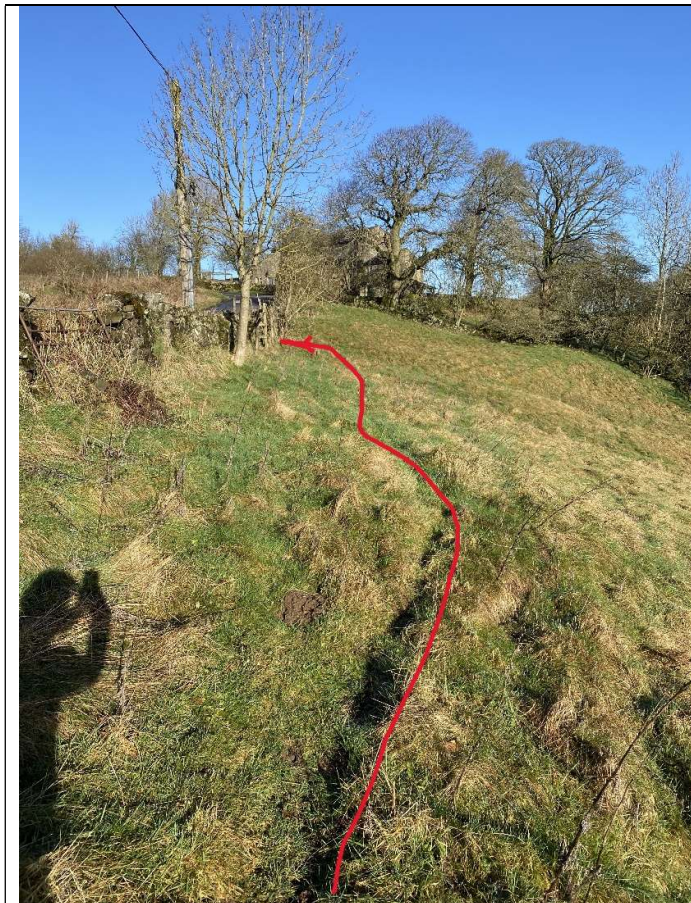
9 - continue to stile at SE15505690