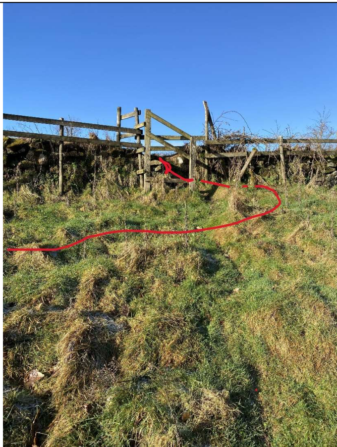
10 - over stile and turn right up road