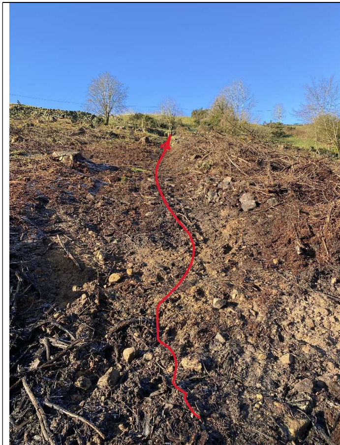
5 SE15605688 - continue to stile