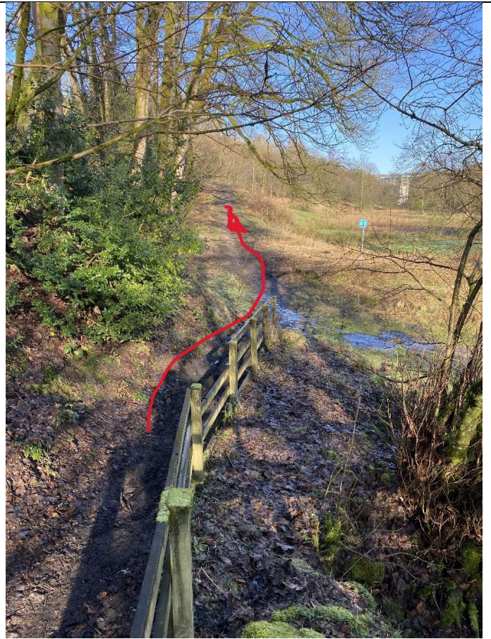
2 SE15725682 - up track to junction