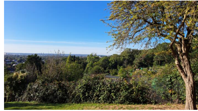
Jackie & Gill B. completed a few more legs of The Capital Ring between Crystal Palace and Richmond