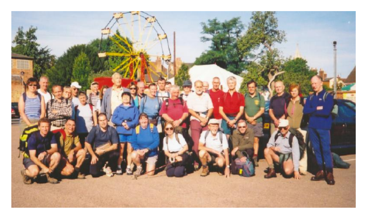
Start of the 20th Anniversary Walk