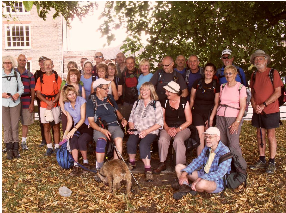
At the Founders' Memorial Bench at lvinghoe