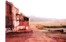
Fingringhoe Mill 1997