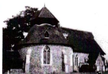
St John's Little Maplestead

49 walkers attended the inaugural use of this route for an event Sun 28th February 88, but, it was the 42 who turned up in snow five years later, who won our title, (with apologies to Burl Ives) That snow thawed before lunch-time and made the top contact layer of boulder clay soils inescapably glutinous.