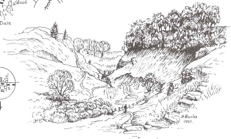
View of Deep Dale from the track.