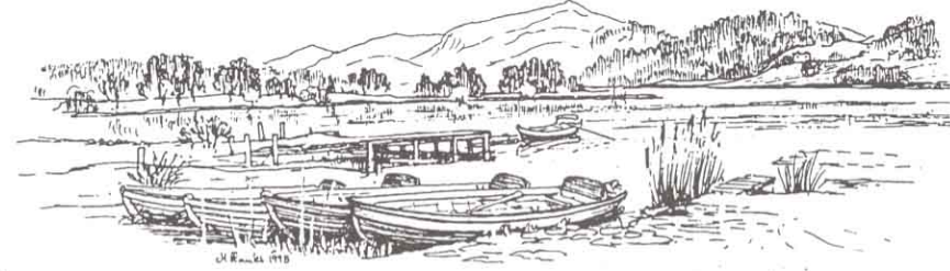
Grasmere Lake from boat hire jetty

Last home of Wordsworth. This interesting house and attractive gardens is open to the public all year.