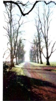
RT. Langham St Mary's Church Drive South

K > L Langham, Gun Hill TM042334 to Mistley Station TM119318 to Explorer 196 Depart K carefully over Gun Hill S E to gain side-walk of Stratford Road over the A12. E of the carriage-ways note path off right up to Coles Oak Lane level. Use it. Go E along Lane to next path left. Wriggle through Moorat Park to find more Stratford Road. Lead E, cross road on path by a cricket pavilion and turn N to Dedham's Royal Square. Depart E to bend of Brook Street, Use path by Muniment House leading N E beyond Dedham Hall to the Stourside at its confluence with Dedham Old River. Continue downstream to Flatford's attractions. Resume with river left-side to the many sluices of the old river at Judas Gap. Move along E on the S seawall of the Stour Estuary. Swap to map 184, to step over Lawford's White Bridge A137 and wriggle through tiny Manningtree and enjoy a grand finale along Mistley's Walls, where no walls hold off high-tides. Onward to the to the Station L also along the B1352.