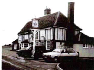
Warmingford Crown. RT