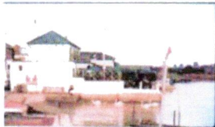
Wivenhoe, Fingringhoe Ferry point at Rowhedge on Colne Estuary